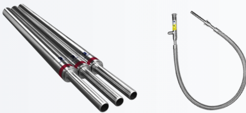
Vacuum Insulated Rigid & Flex Lines

All Bayonet Connection products come with CSM renowned customer service, from conceptual design to implementation, and are backed by 1-year Defect Warranty.